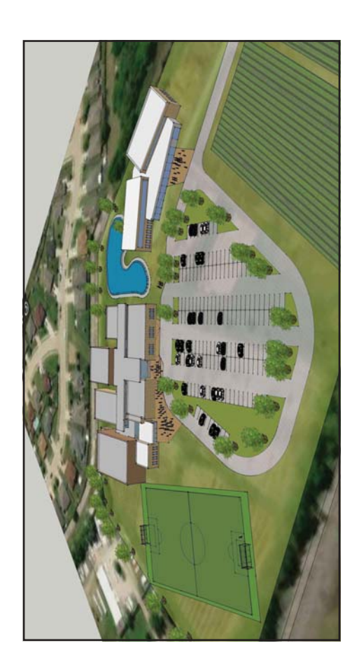
Denton Social Services Vision & Strategy June 2019