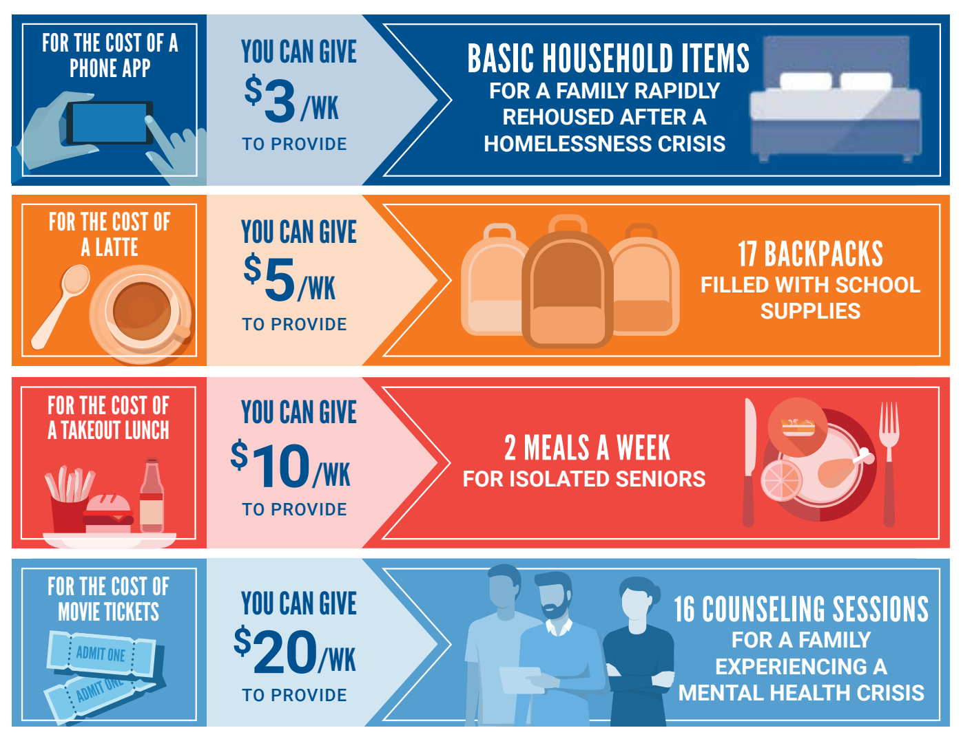
Download full poster from our online Toolkit.